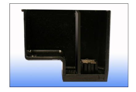
Cross-section of HP with separating wall.

The ink cartridge HP 336 has a separating wall within the ink chamber (see Fig. 1a). After removing this separating wall by either cutting or breaking them out the full cartridge capacity can be utilised (see Fig. 1b). The ink supply of the HP 336 to the preceding nozzle chamber (filter area) is lower than for example with the HP 338 ink cartridge. This difference in height is bridged by a custom formed sponge (see Fig. 1c). Using this sponge the chamber will be completely filled. Samples are available on request.