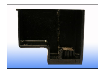
1b) Cross-section of cartridge after separating wall has been removed.